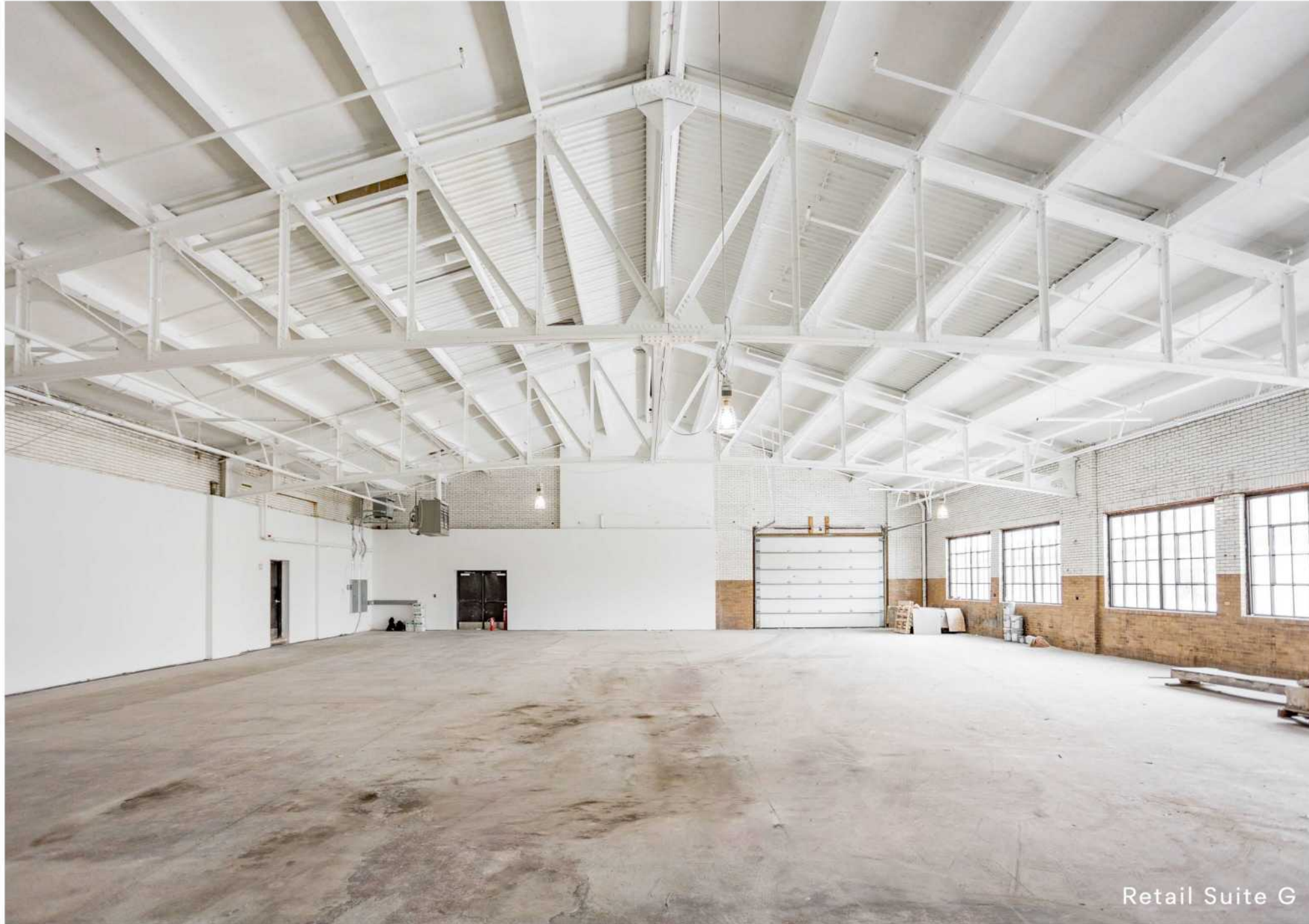
Retail Suite G