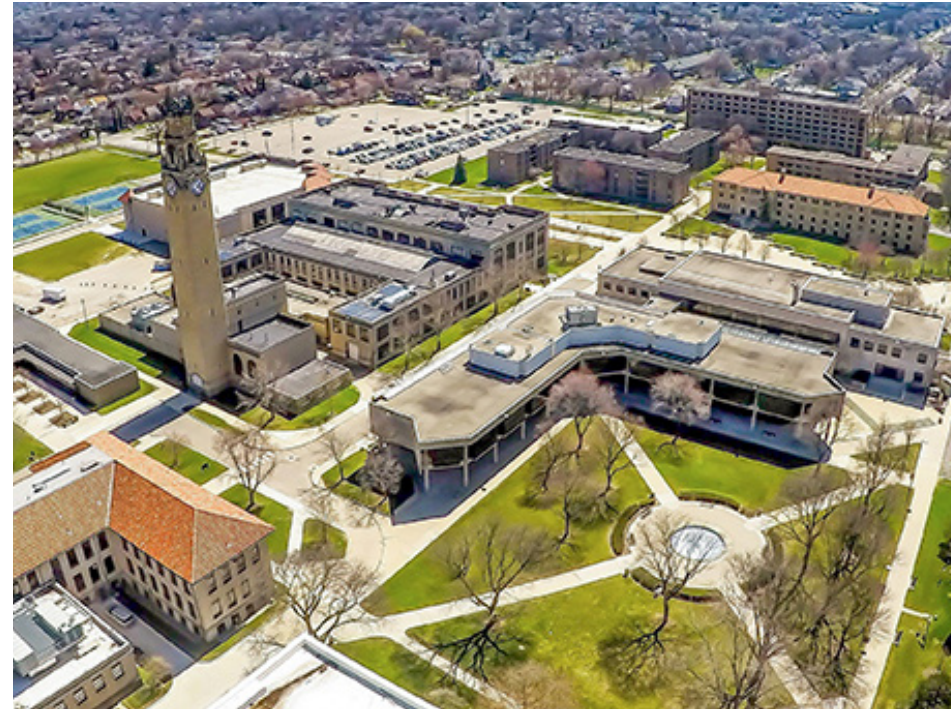
University of Detroit Mercy

Palmer Park is one of Detroit’s hidden gems—a 296-acre urban oasis filled with scenic woodlands, open meadows, and a beautiful lake. It’s a favorite spot for outdoor activities like hiking, biking, tennis, and picnicking.