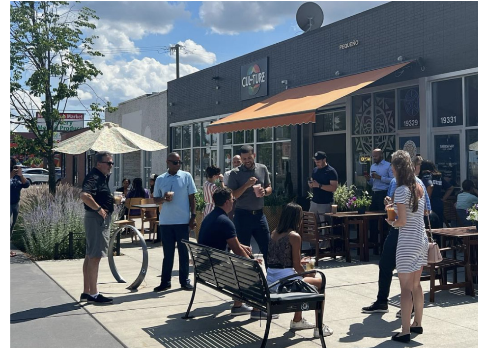
Avenue of Fashion

The University of Detroit Mercy, established in 1877, is Michigan’s largest Catholic university, offering diverse programs in business, engineering, law, and healthcare. In the 2025 Wall Street Journal/College Pulse rankings, it was ranked #43 nationally and #2 in Michigan.